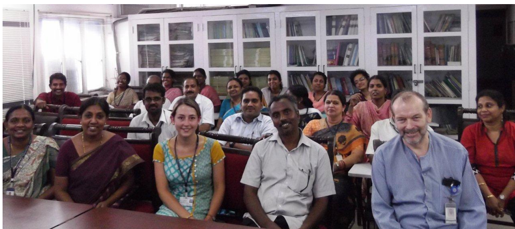
Clinical Chemistry Group