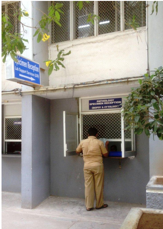
Pathology Specimen Reception