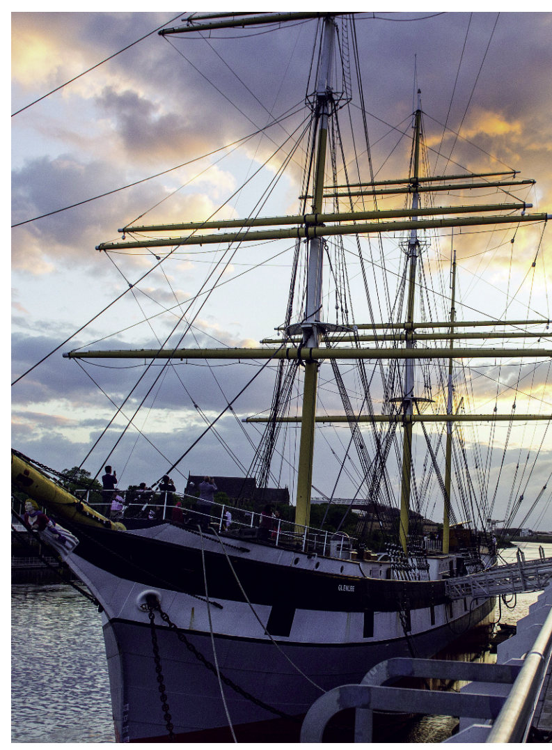
The Tall Ship, venue for the Focus 2019 conference dinner

For FiLM 2020, additional members on the Committee supported the scientific programme activities. Sponsorship packages were redesigned to encourage enhanced participation from our colleagues in industry. A new Young Leaders Programme encouraged the pathology leaders of the future. Registered delegates had the opportunity to bring a Trainee to the conference at a heavily discounted price.